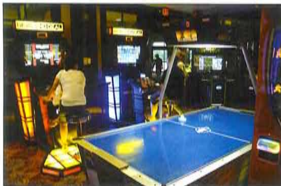
Deal or No Deal was expected to be so popular at Firkin and Kegler that Hot Shot Amusement installed two.