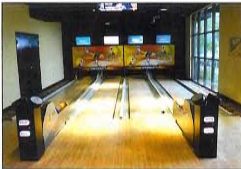
For those who can't wait to strike on the big lanes, there's mini bowling conveniently offered right by the front entrance.