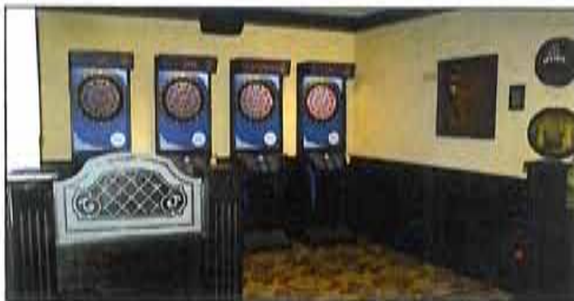
Shell dart boards await smart wrist action from guests getting competitive. The boards are located off the billiards room upstairs.