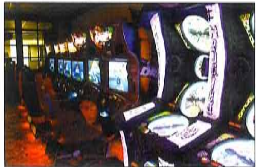
Fast and Furious Drifts and Haunted Adventures glow temptingly in the gameroom's ambient lighting.