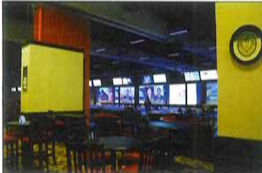
Lanes of Their Own: curtains may be drawn to give more privacy to special groups who want to better enjoy one another's company.