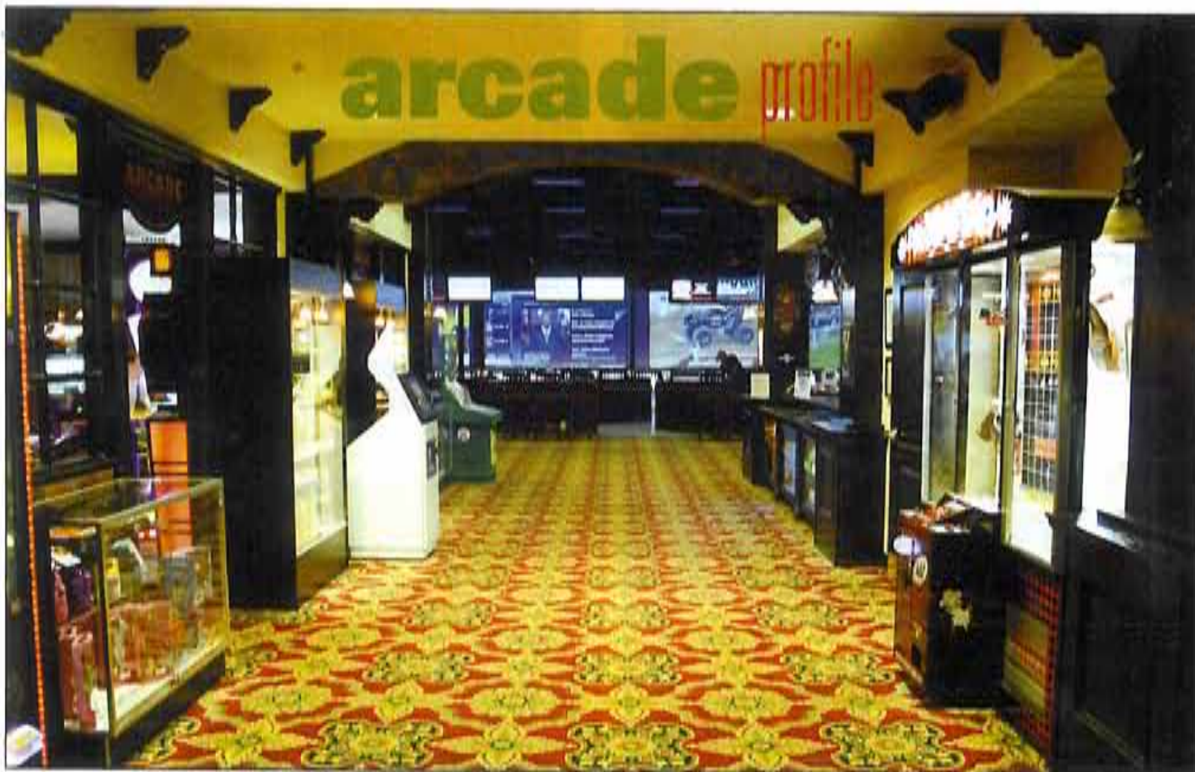
The central hallway of The Firkin and Kegler FEC curves past a restaurant, mini bowling, golf simulator and the gameroom before spilling into the main attraction.