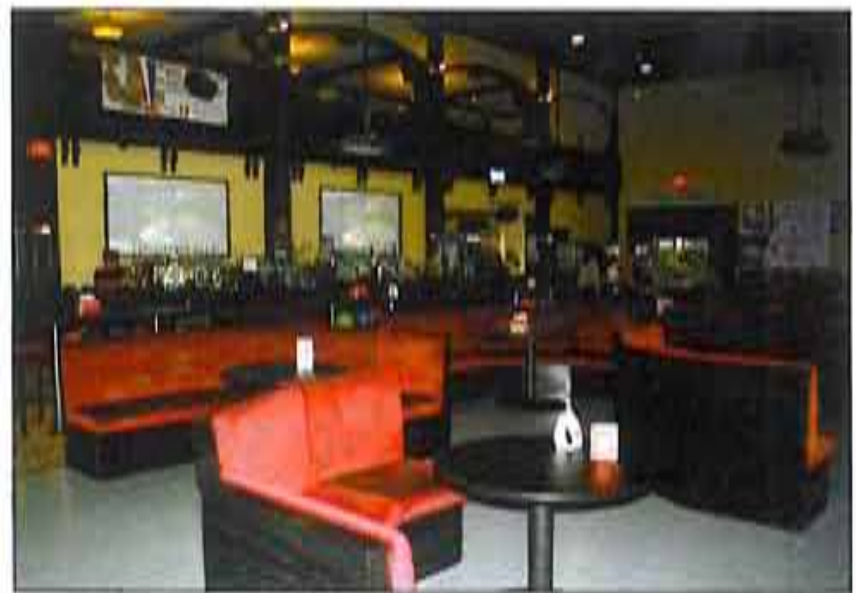
Stylish red-velvet seating trumped the idea of traditional booth designs for bowlers waiting their turn.