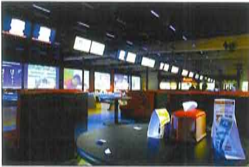
Thirty-two lanes of bowling glow from neon lighting and the large TV screens at the Firkin and Kegler FEC.